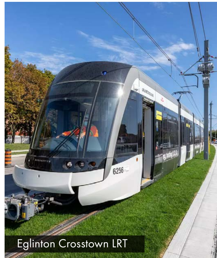
Eglinton Crosstown LRT